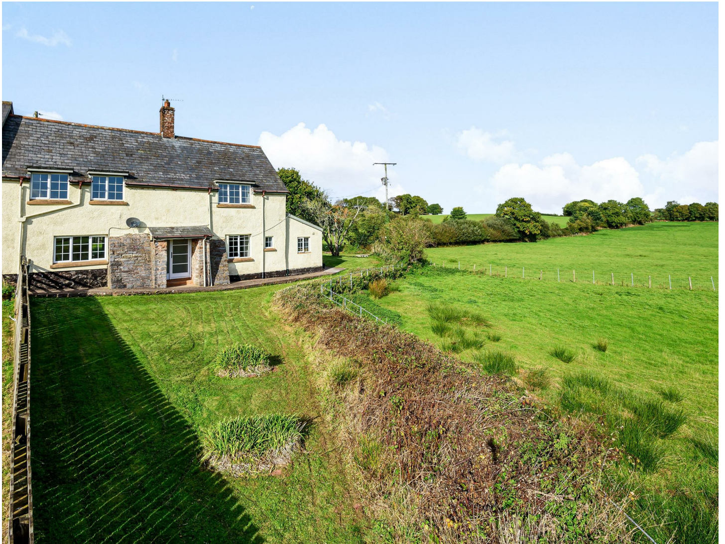
2 Murley Cottages